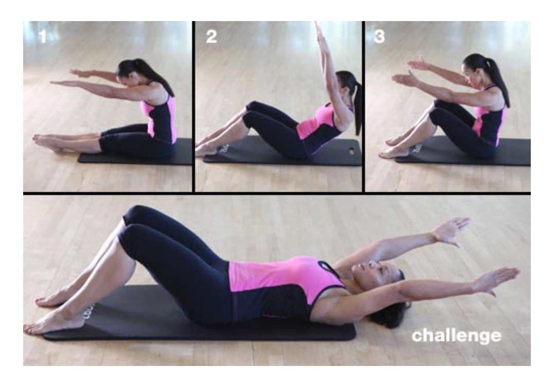
SLIDE 4 / 18