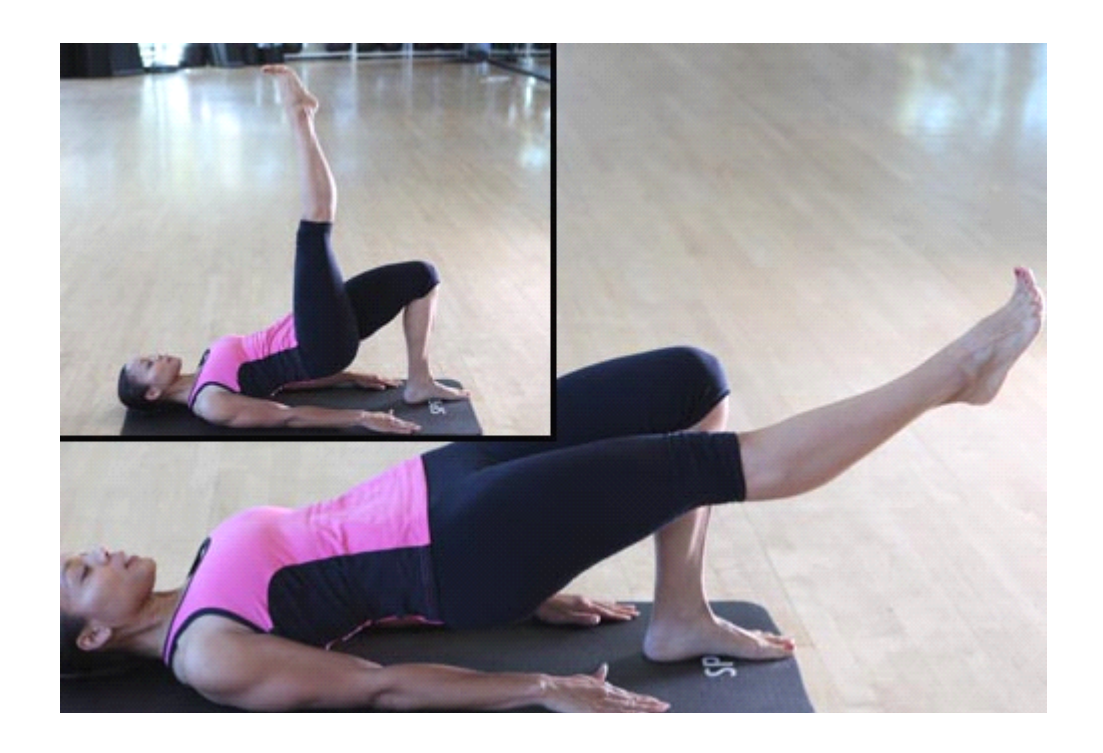
SLIDE 8 / 18