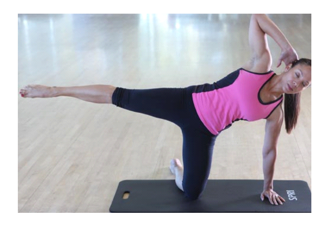
SLIDE 14 / 18