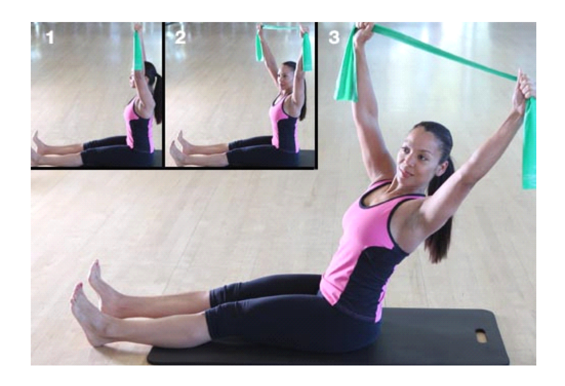
SLIDE 6 / 18