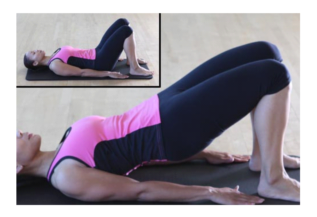
SLIDE 7 / 18