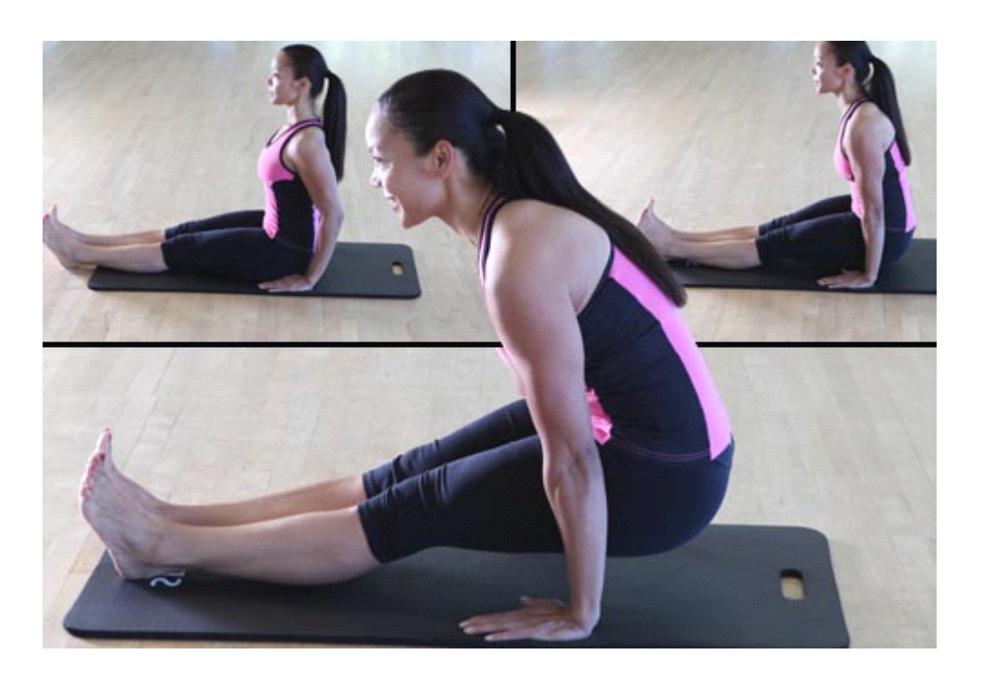
SLIDE 11 / 18