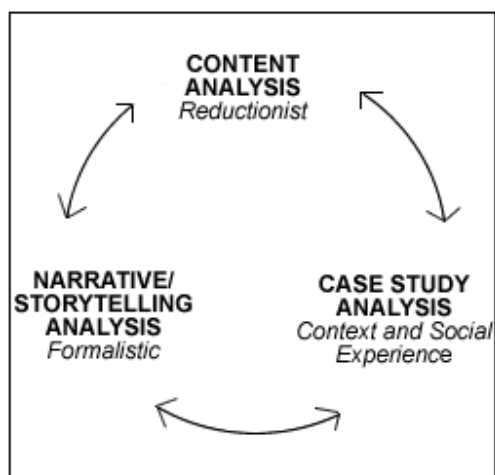
Figure 2: Three integrated approaches for interpreting data from learning logs

analysis, or some combination of the three (Friesner and Hart 2005).